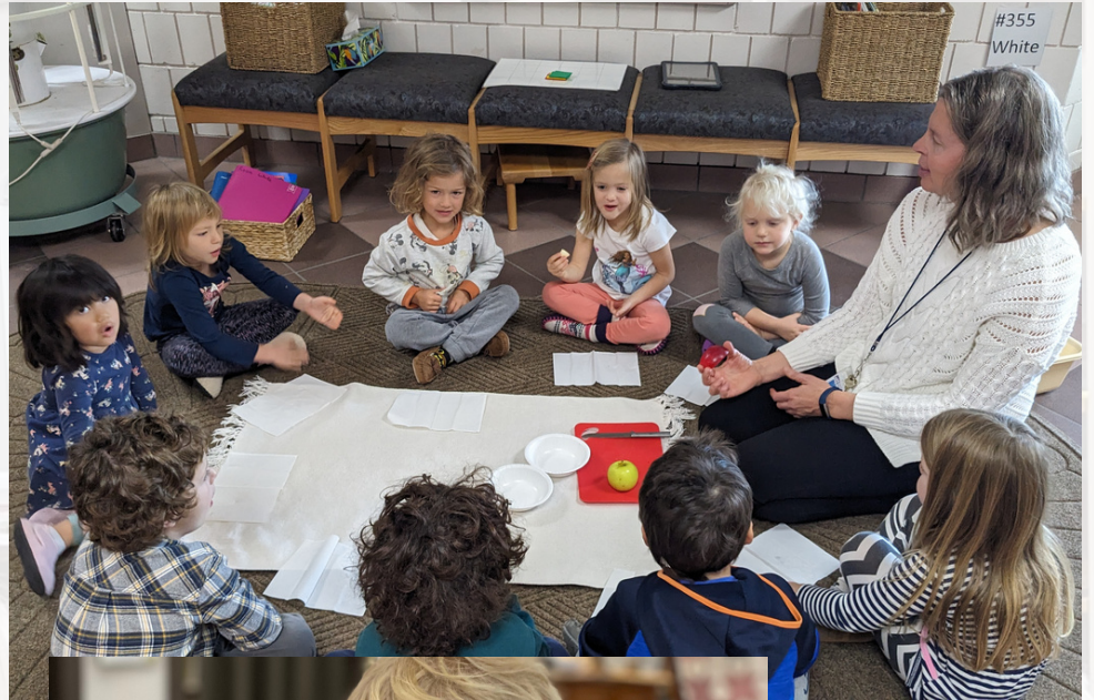
Children's House - students are really getting the hang of things. They're moving on from learning how to be at school to focusing meaningful works.