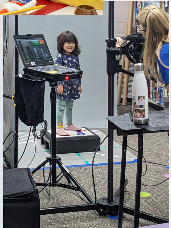
Picture Retake Day - Picture retakes were a success. If you missed out, please see page 7 of this newsletter to schedule your pictures.