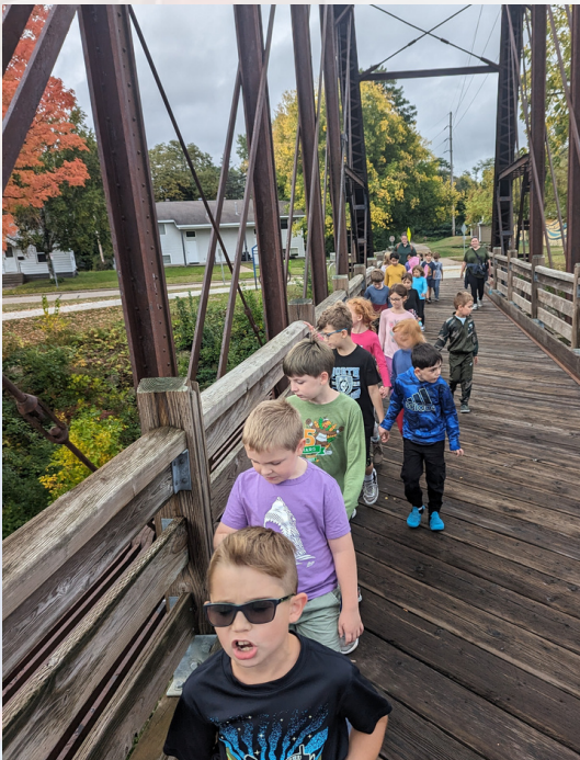
Field Trips are getting ready to wrap up for the season. Fall has been a great time for students to get out there for a variety of field trip opportunities. This week, E2 is taking a trip to Banbury Place and E1 is going to see 'The Boxcar Children' play,