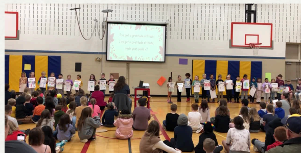
1st grade has a Gratitude Attitude at our last All-School meeting. Click to watch the video.