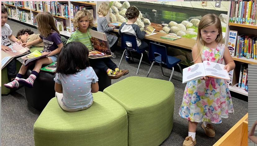
New library seating and counter