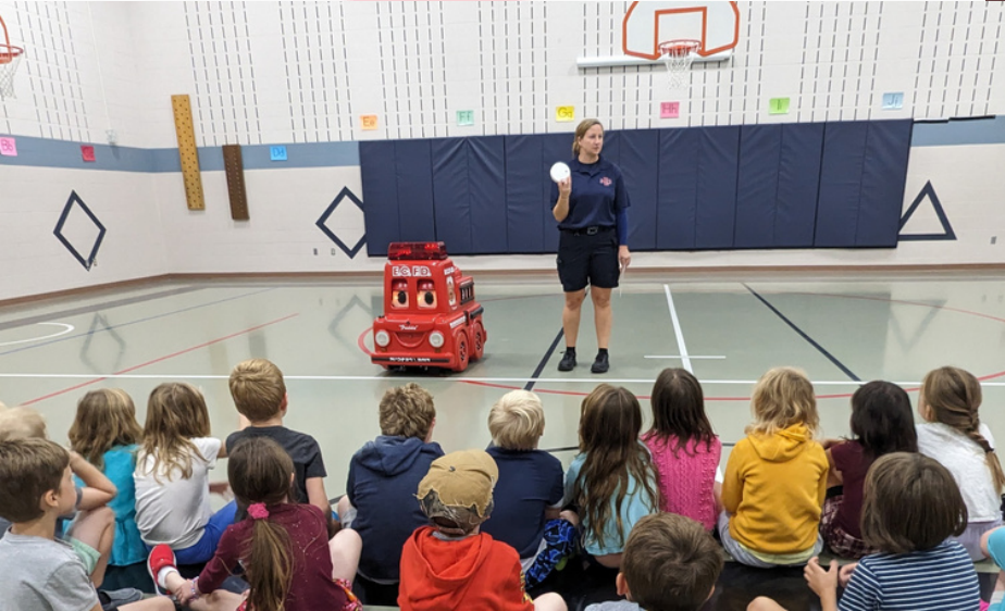
EC Fire Department showed us all how to be safe in case of a fire