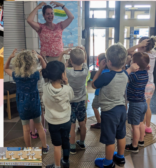
Children's House is learning the ropes of being school