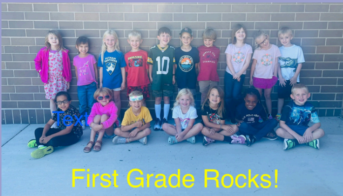
First Grade Rocks!