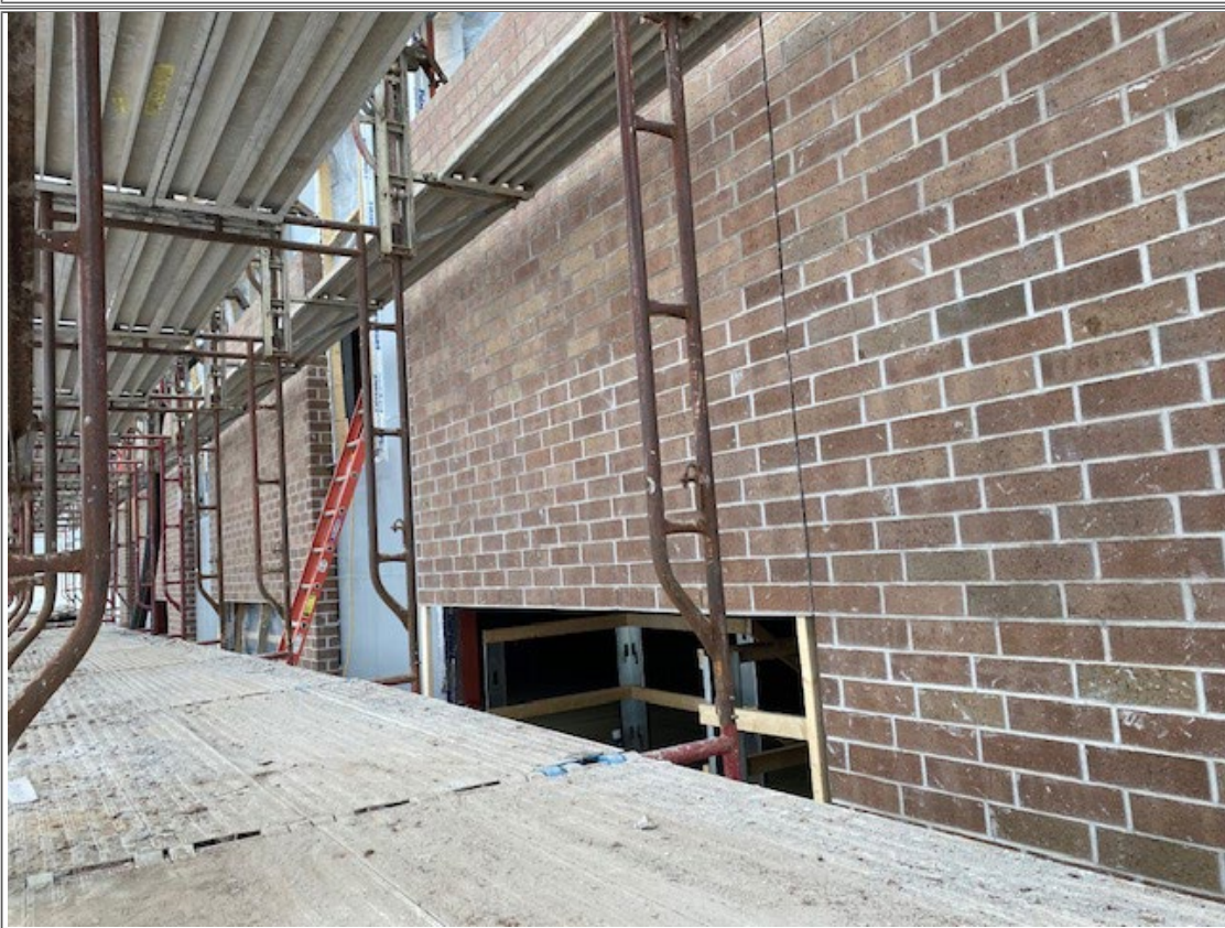
Brick area A