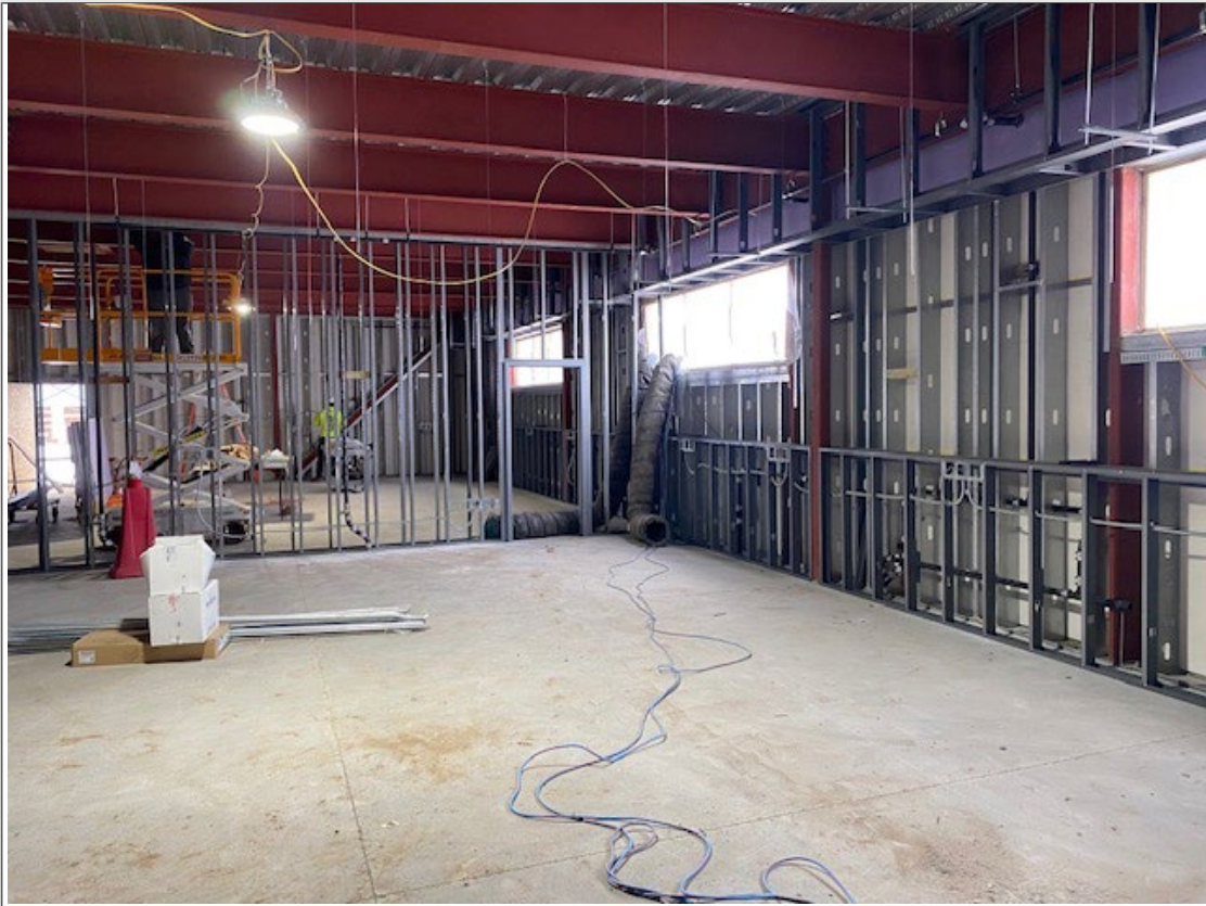
framing walls in science room addition